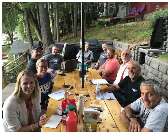
August 2019 Board Meeting