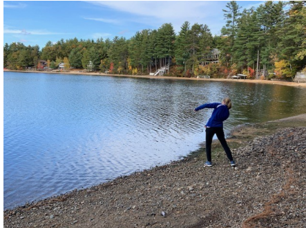
Fall and Winter on the Lake